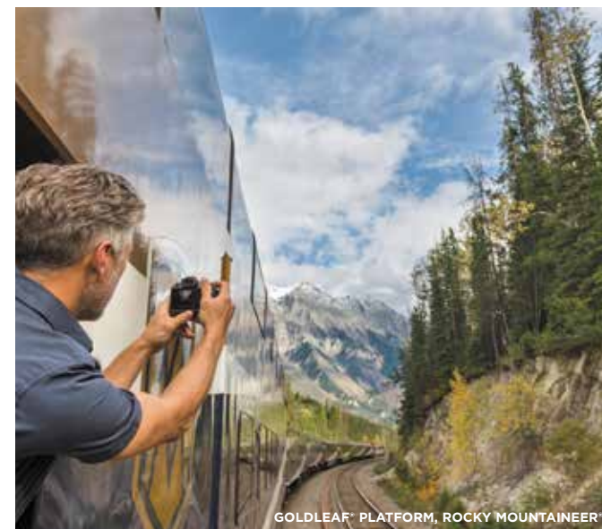
GOLDFLEAF® PLATFORM, ROCKY MOUNTAINEER®