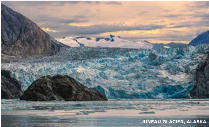
JUNEAU GLACIER, ALASKA