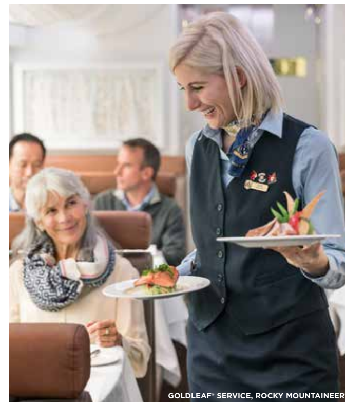
GOLDFLEAF® SERVICE, ROCKY MOUNTAINEER®