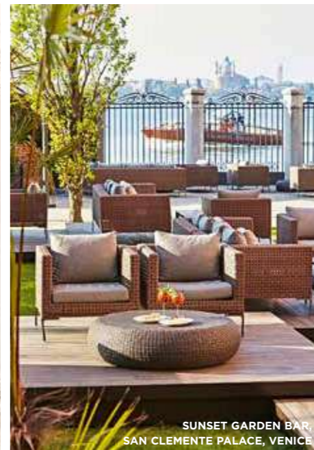
SUNSET GARDEN BAR, SAN CLEMENTE PALACE, VENICE