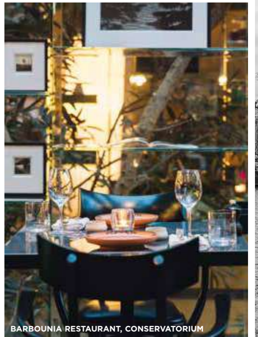
BARBOUNDIA RESTAURANT, CONSERVATORIUM