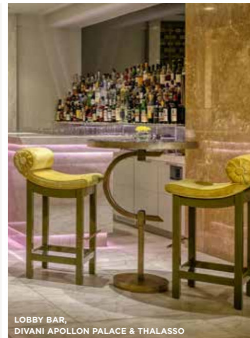
LOBBY BAR, DIVANI APOLLON PALACE & THALASSO