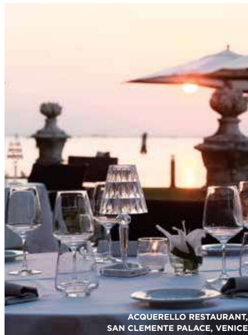
ACQUERELLO RESTAURANT, SAN CLEMENTE PALACE, VENICE