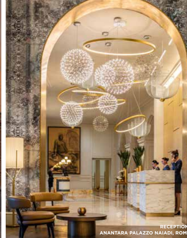
RECEPTION, ANANTARA PALAZZO NAIADI, ROME