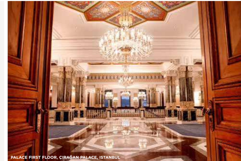
PALACE FIRST FLOOR, ÇIRAĞAN PALACE, ISTANBUL