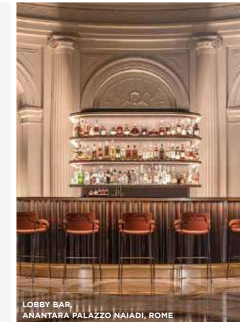
LOBBY BAR, ANANTARA PALAZZO NAIADI, ROME