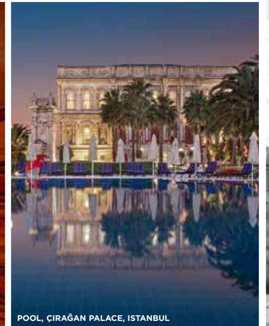
POOL, ÇIRAĞAN PALACE, ISTANBUL