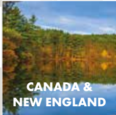
CANADA & NEW ENGLAND