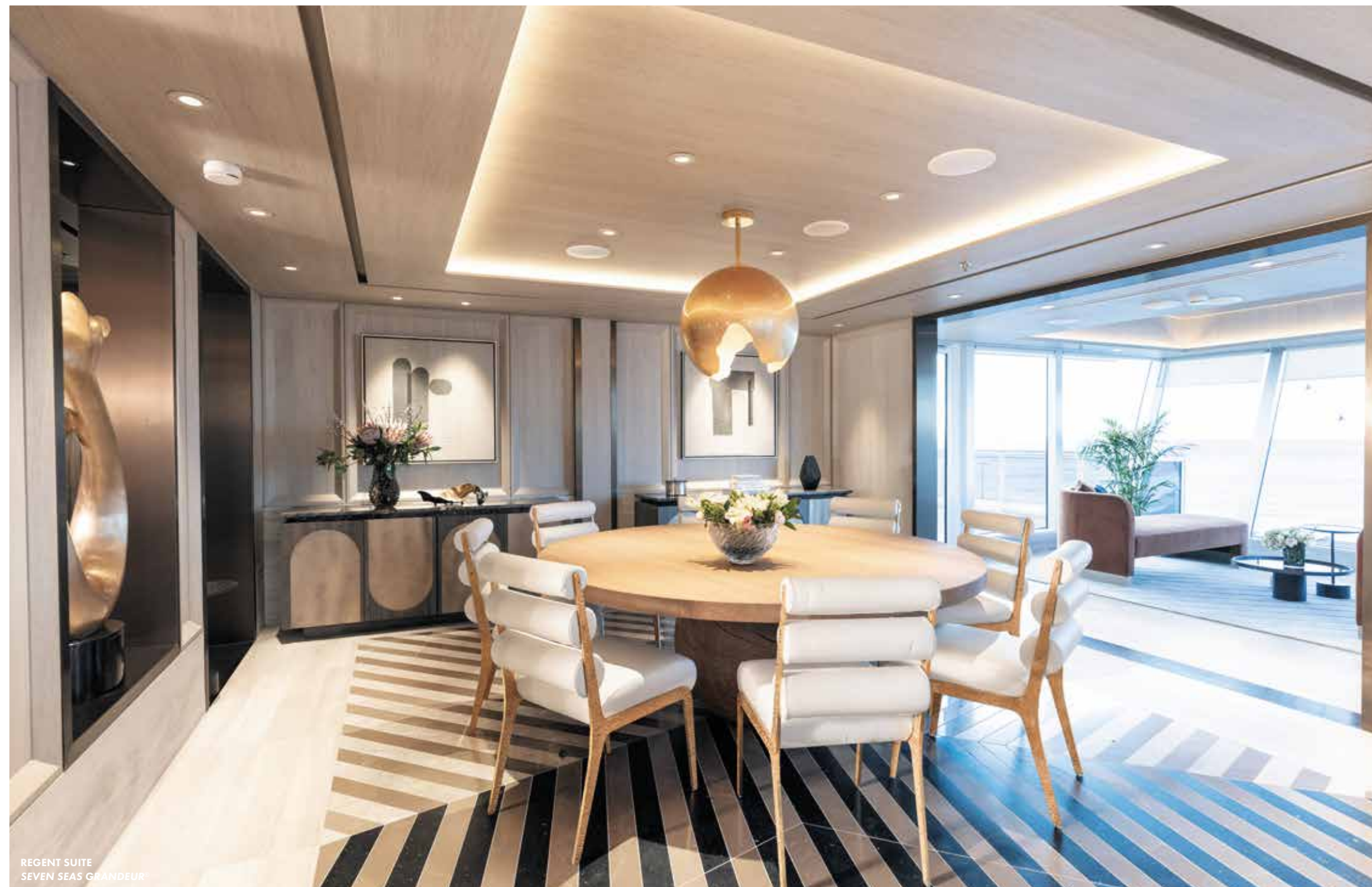
REGENT SUITE SEVEN SEAS GRANDEUR®

We want you to live every moment of your journey to the fullest, free of care or concern about anything other than whatever and whomever you're enjoying as you cruise the world with us. Come aboard and discover why Regent Seven Seas Cruises is the best luxury experience.