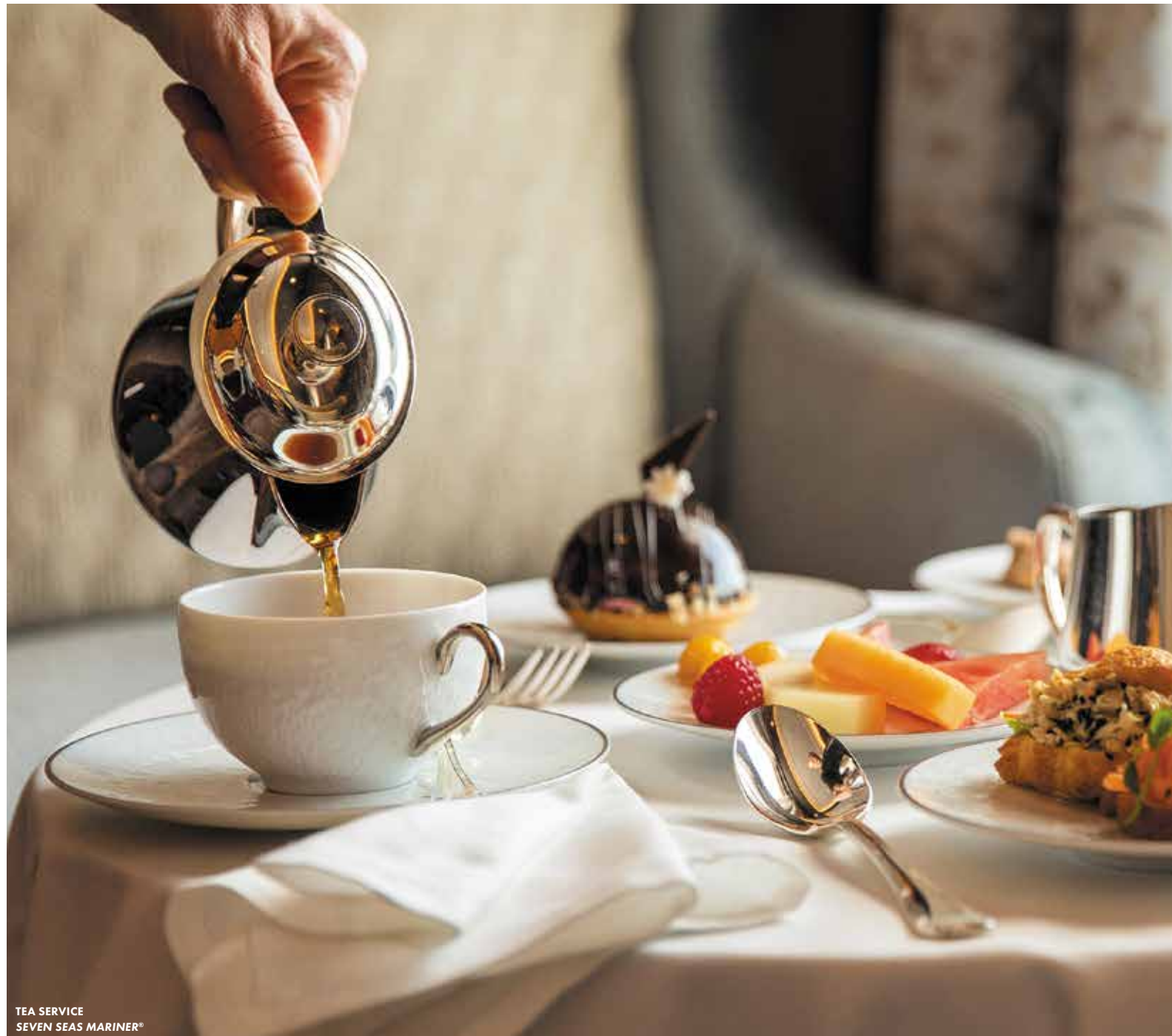
TEA SERVICE SEVEN SEAS MARINER®

Let us tend to your every want and whim so that you may enjoy the pinnacle of what travel has to offer, making the most of every moment.