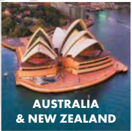
AUSTRALIA & NEW ZEALAND