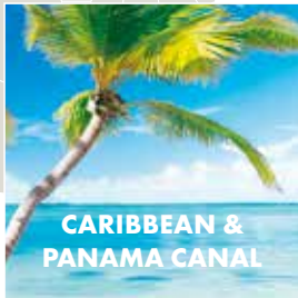
CARIBBEAN & PANAMA CANAL