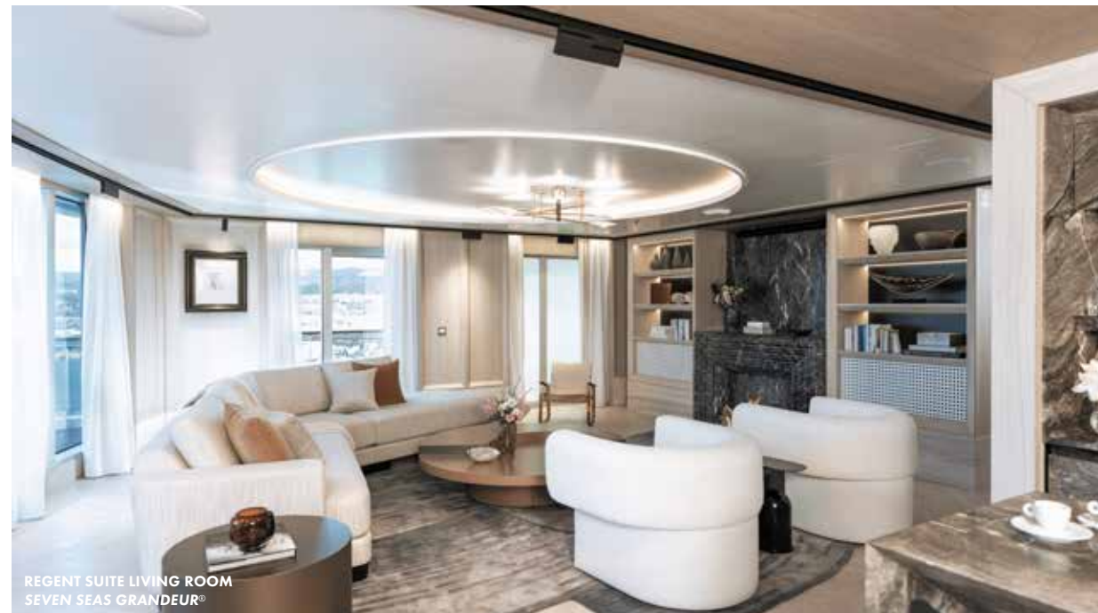
REGENT SUITE LIVING ROOM SEVEN SEAS GRANDEUR®