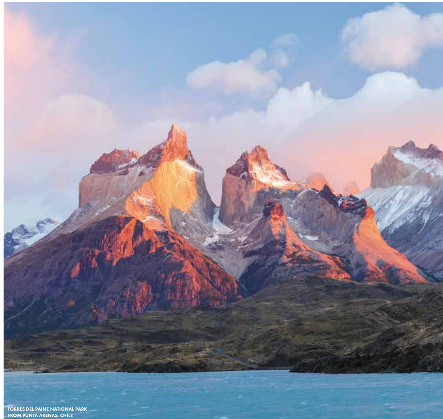
TORRES DEL PAINE NATIONAL PARK FROM PUNTA ARENAS, CHILE

Sail with us into those wondrous horizons and experience more than ever, one beautiful day at a time.