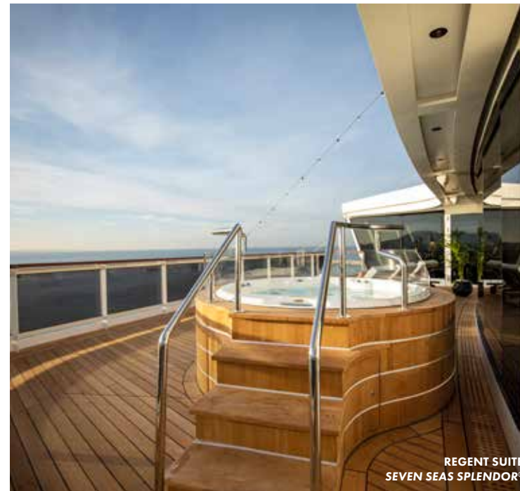
REGENT SUITE SEVEN SEAS SPLENDOR®

Our Deluxe Suites deliver a level of hospitality and service a step above the competition with amenities such as a welcome bottle of champagne, 24-hour room service and much more.