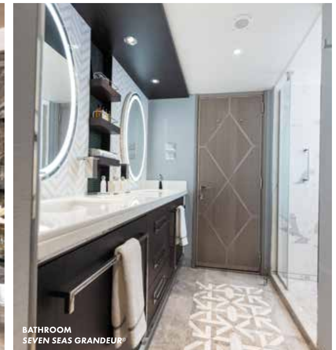
BATHROOM SEVEN SEAS GRANDEUR®