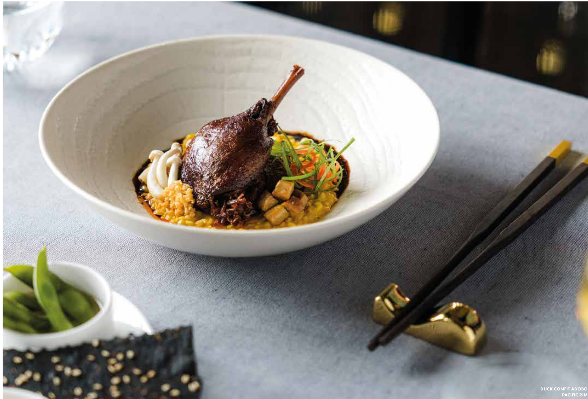
DUCK CONFIT ADOBO PACIFIC RIM