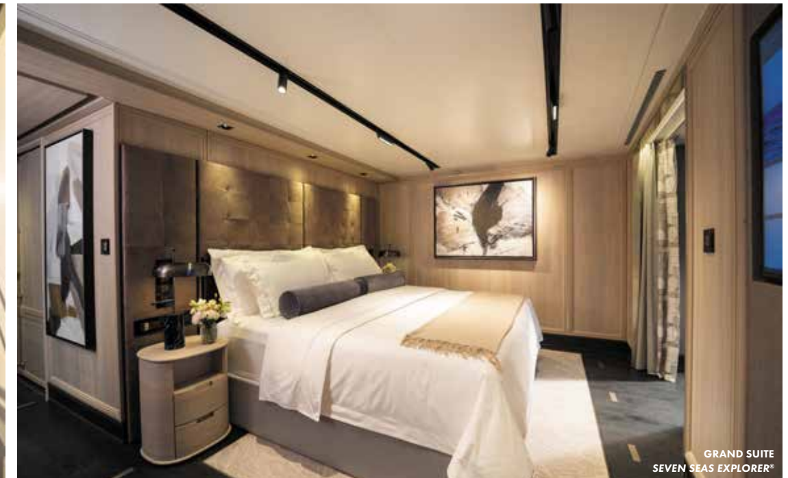
GRAND SUITE SEVEN SEAS EXPLORER®