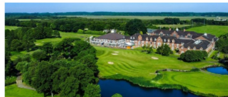
Legendary golf at Formby Golf Club