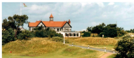
Play golf at Hesketh Golf Club