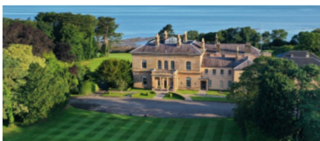
Royal Belfast golf experience