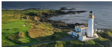
Tee off at Turnberry (Ailsa)