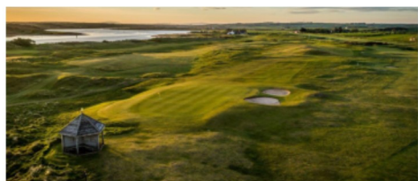
Golf at Portstewart with Annika Sörenstam

We are excited to unveil optional Regent Choice Excursions exclusively for the Spotlight Voyage on Golf with Annika Sörenstam.