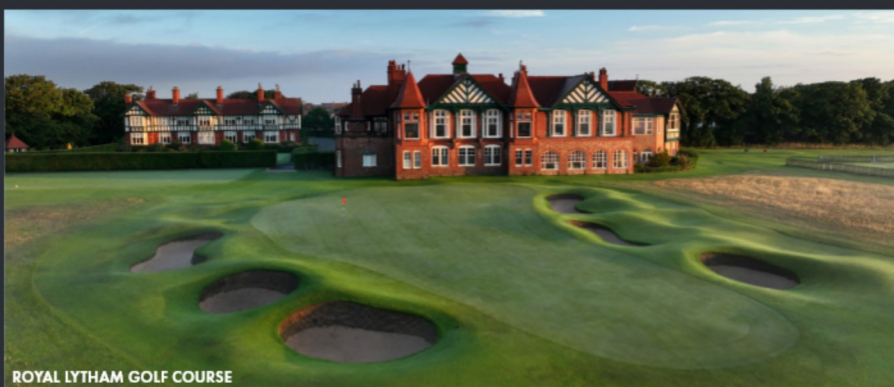
ROYAL LYTHAM GOLF COURSE

Set sail next summer on an unforgettable golf adventure aboard Seven Seas Grandeur ® with our exclusive Spotlight Voyage featuring golf legend, Annika Sörenstam . This 7-night journey includes complimentary golf-themed immersion onboard and the chance to play 18 holes at seven iconic, award-winning British courses — all in Annika's inspiring company.