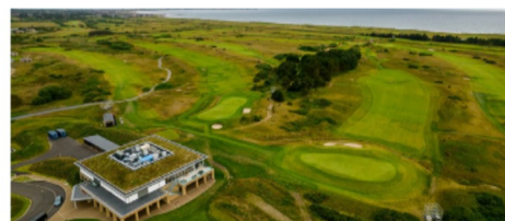
Play golf at Dundonald with Annika Sörenstam